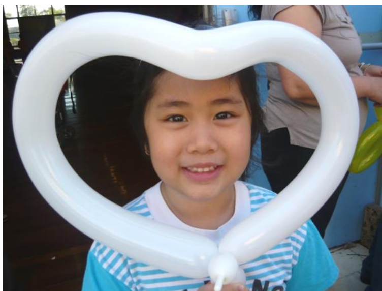
Guests scoring lucky door prize (top) and kids loving the balloon bending at the community Christmas party.